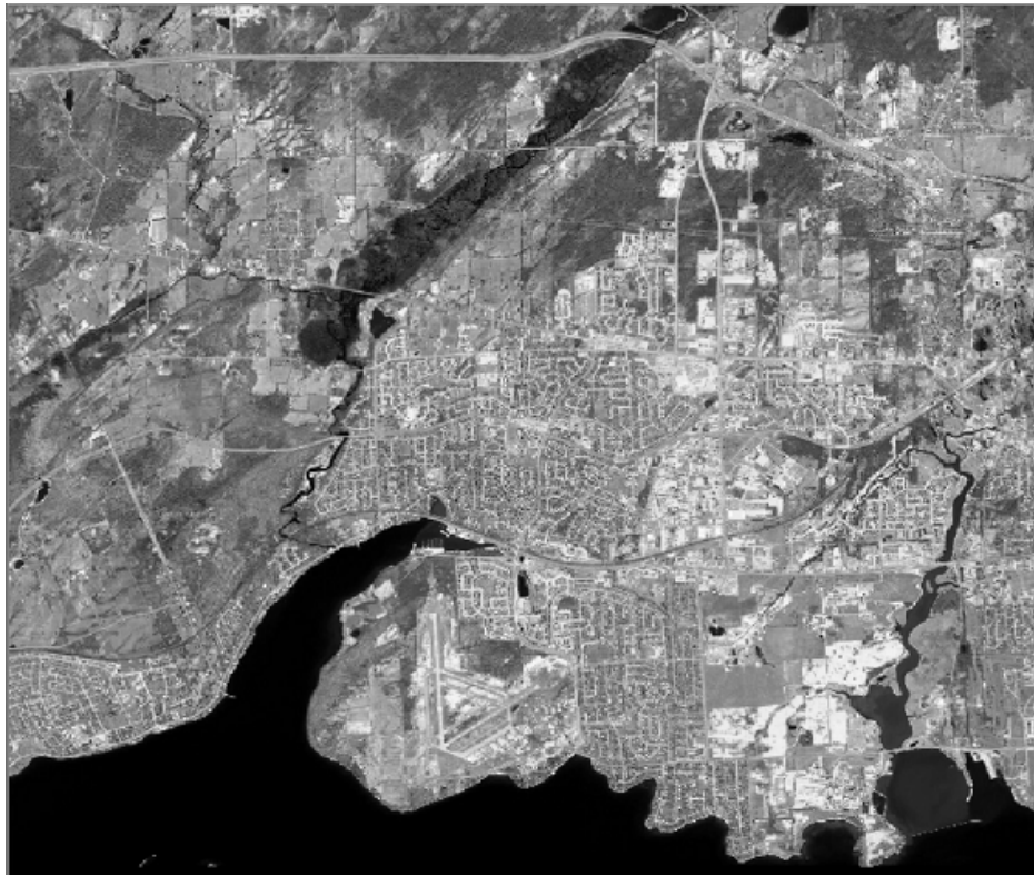
Figure 3. The near infrared (NIR) band of IKONOS image covering the study area.

The wavelet decomposition provides a set of coefficients at each pixel. For example, a one-level wavelet decomposition provides four coefficients, namely, the four spectral (or density ) values in each of the four sub-images. An approach based on the direct use of wavelet decomposition coefficients is investigated in our study. The wavelet transform not only separates the trend from details as many other filtering methods do, but it also presents both sets of information at multiple scales. The wavelet coefficients in the approximation and detail sub-images are usually summarized by several indices that represent the underlying properties of the images. Widely used indices are statistical in nature, ranging from simple ones, such as mean and standard deviation, to more complex varieties, such as entropy measures (Pesaresi, 2000; MyInt, 2000).